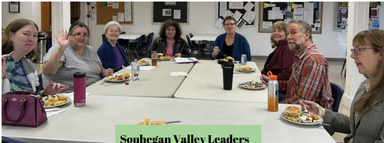
Souhegan Valley Leaders

The Souhegan Valley GSOP Chapter is engaged in efforts and initiatives aimed at promoting social justice and fostering community solidarity. The Chapter meets monthly to discuss ongoing projects, plan new initiatives, and engage with community members. We organized a successful Juneteenth event in 2023 attended by over 100 people and covered by the Boston Globe and New Hampshire Public Radio (NHPR). Our event was one of only four Juneteenth celebrations in the state. We are currently planning to hold this event again in 2024.