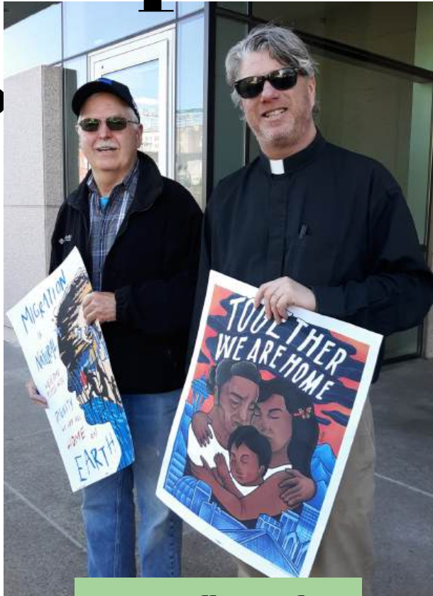
Upper Valley Leaders

Last winter, Claremont community members and congregations came together to open an emergency winter night drop in shelter. Recently we composed and adopted a "Housing Statement" that can be read at various meetings or sent to officials with power to make a difference.