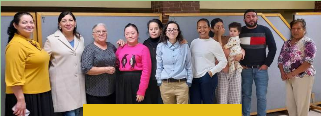
Latino Leadership Graduates

We expanded our Leadership Training into Spanish! Nine Latino Leaders in Manchester completed the leadership training course. Since graduating, the group met with elected officials to discuss issues in their communities, and measures to address access to healthcare and concerns about the environment. They led a Community clean-up event, removing trash from a local park, and a Health Fair to share information in Spanish about different service providers around NH.