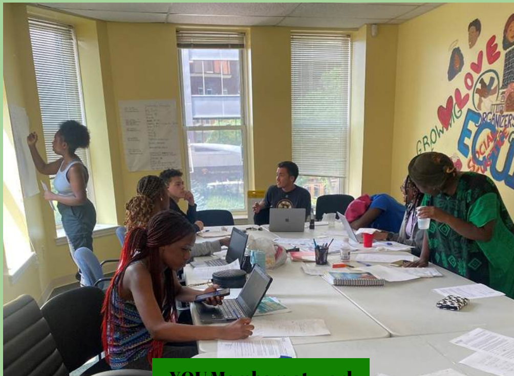
YOU Members at work

Lastly, we have begun inroads to new YOU chapters in both Raymond, Goffstown, and Nashua.