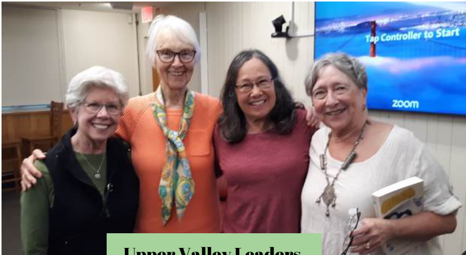
Upper Valley Leaders